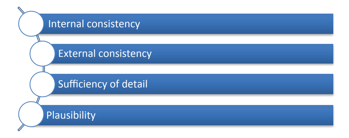
Figure 4: Credibility indicators

The need to have a common understanding as regards indicators of credibility arises from the principle requiring an impartial and objective assessment of each application and helps to ensure a transparent and consistent assessment. The indicators are to be applied to the material facts taking into account all the evidence with the purpose of determining which material facts can be accepted as established for the purpose of assessing risk.