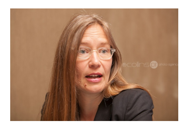
Hilkka Becker, Chairperson of the International Protection Appeals Tribunal (IPAT)