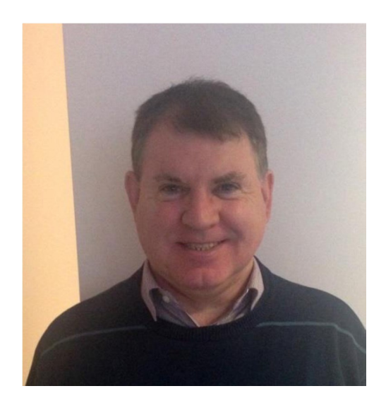
David Goggins, Refugee Documentation Centre