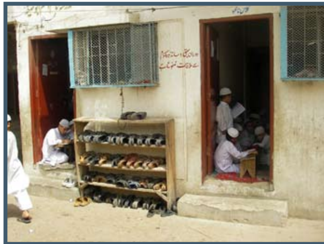
Afghan children in Pakistan often attend a madrasa