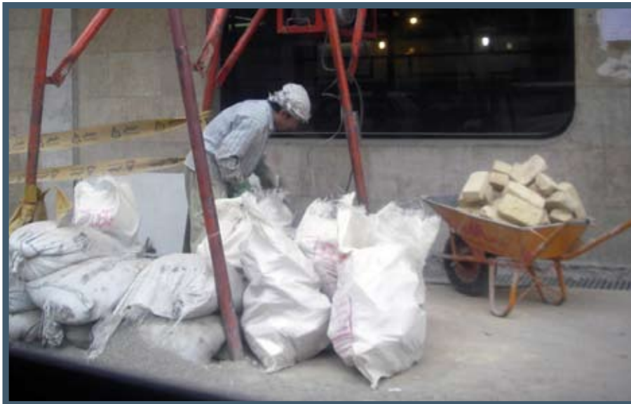
Afghans living in Iran like this man are restricted to certain forms of labour, usually manual