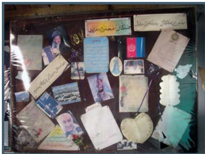
The pin-up board at an Afghan School in Pakistan