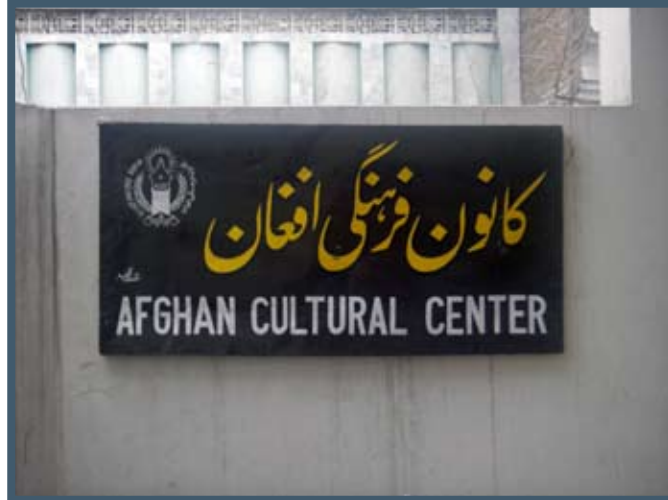
An Afghan cultural institution in Pakistan