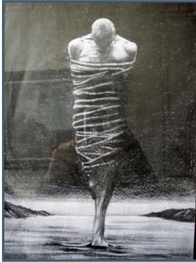
A painting by an Afghan youth living in Iran