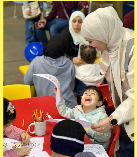
A community-based activity at a UNHCR-supported CDC, providing a safe space for displaced families to connect, seek support, and restore a sense of routine.

These centres are a cornerstone of UNHCR’s commitment to refugees’ inclusive access to protection services, localisation, accountability to affected people, and community-driven solutions, ensuring assistance remains responsive, dignified, and grounded in community priorities. CDCs are reinforced by Outreach Volunteers , who extend protection services beyond the centres to reach families in collective shelters and public spaces and identify people at heightened risk; however, 80 out of 448 Outreach Volunteers (18%) are themselves displaced , highlighting both the strength and the growing strain on community-based protection mechanisms.