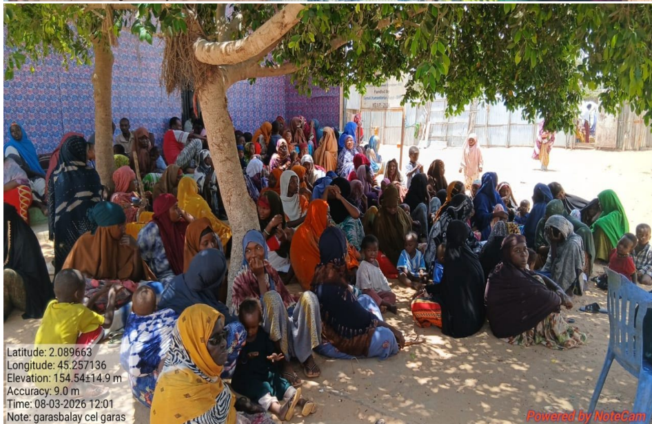
Figures: Newly Displaced people from lower Shabelle at one of the community centers in Garasbaley and Dayniile Camps