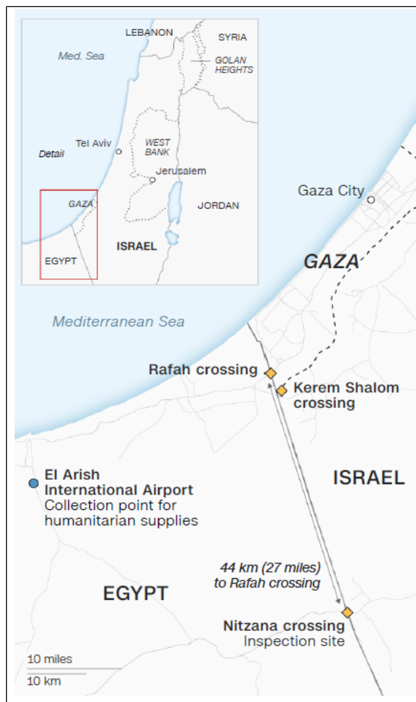
Figure 3. Egypt-Israel-Gaza Border

As of late 2024, an estimated 120,000 Palestinians or more had arrived in Egypt since the start of the war. Egypt has refused to build long term refugee camps for displaced Gazans in the Sinai, though it has accepted the temporary presence of medical evacuees, dual passport holders, and “others who managed to escape.” 12