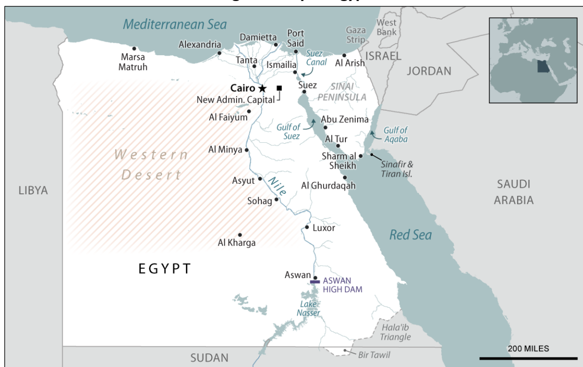
Figure 2. Map of Egypt