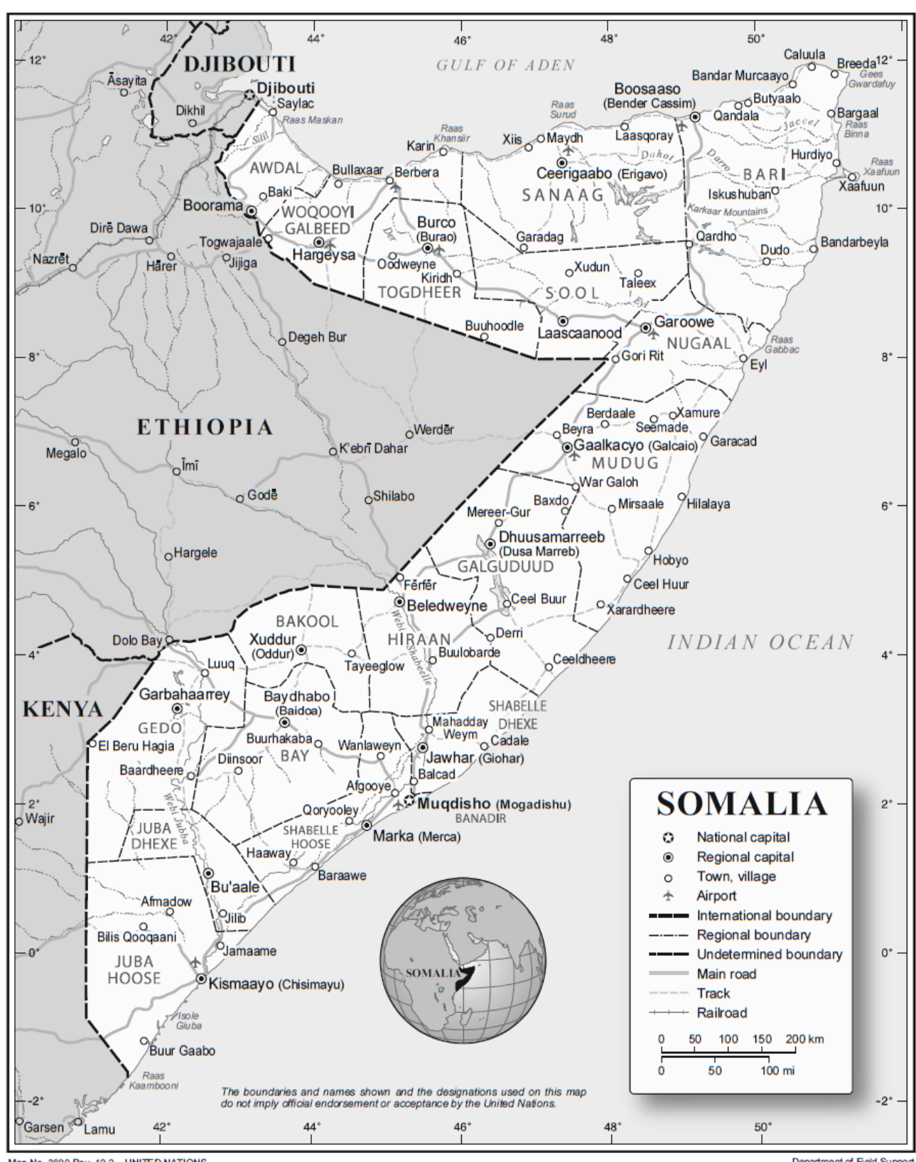
Map No. 3690 Rev. 10.2 UNITED NATIONS May 2014

Department of Field Support Cartographic Section