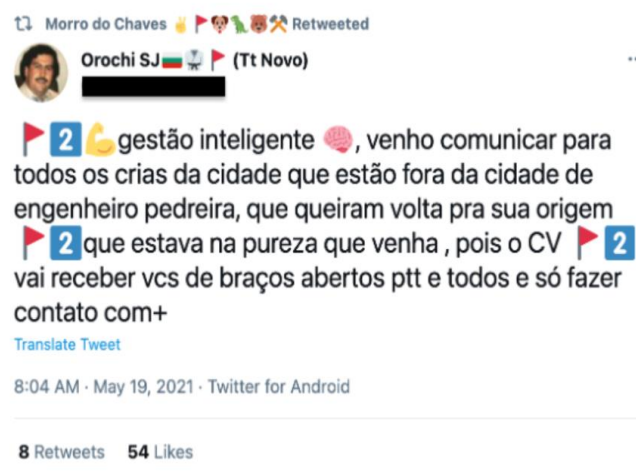
Figure 9: Governance Recruitment

11.2.3 The same source also shared the following social media post from a CV member, describing it as 'a public recruitment call by which the CV chapter of that region was calling the crias (offspring – what they call those born and raised inside a neighbourhood) that have been away from the group and did not engage in treachery or joined a rival, that they are welcome to join back. The call was retweeted by other CV pages... to gain a broader reach' 139 :