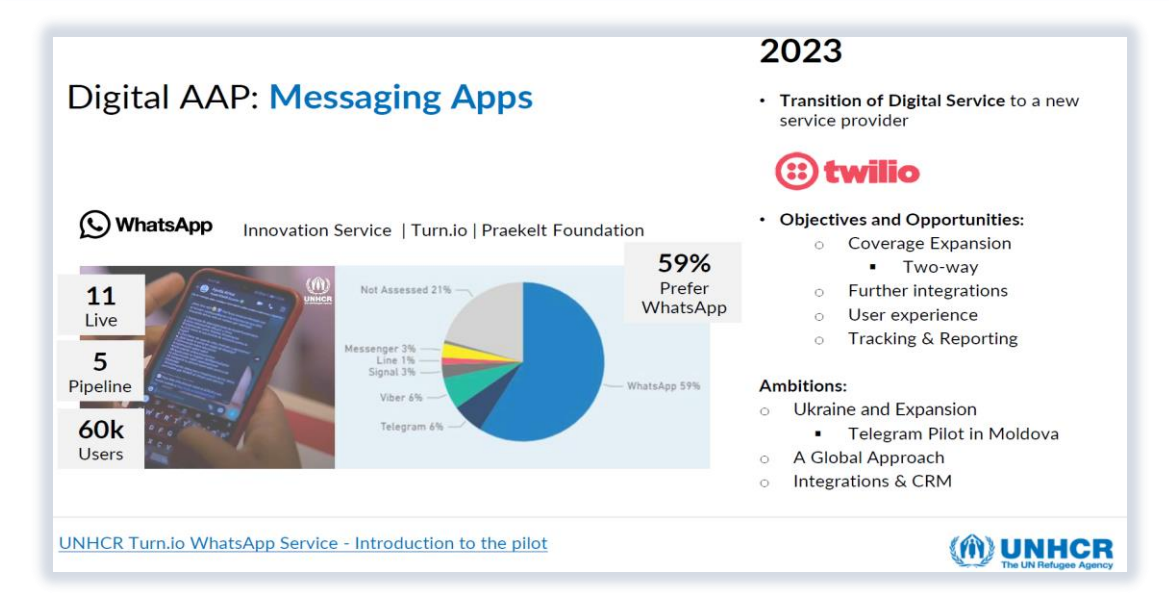
Figure 1: Help pages and messaging Apps reach