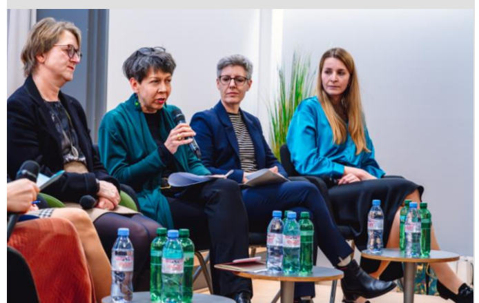
On 28 November, a Panel discussion took place in Bern on Switzerland's engagement in Global Refugee Forum.

UNHCR published a study on free legal assistance for refugees in January.