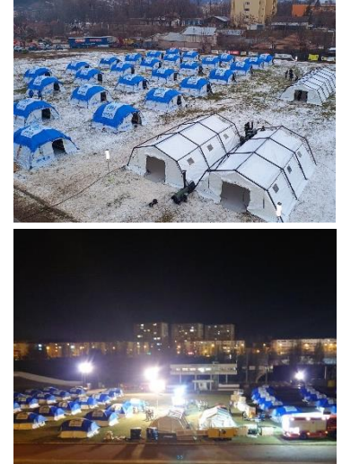
Temporary reception centre in Bacău county

The focus of the drill was on transit shelter facilities located in Bacău and Galati counties. These facilities, established by DSU following UNHCR's provision of shelter and related materials such as family tents and all inside materials, interconnected tents, generators, lighting systems, and heaters. The DSU/ISU teams supported UNHCR's deployed teams from Bucharest, Suceava and Galati, successfully set up shelters on two football fields with the capacity to host 240 persons each. This drill was part of preparedness activities to ensure efficient response in emergencies, testing the capacity to set up temporary shelters.