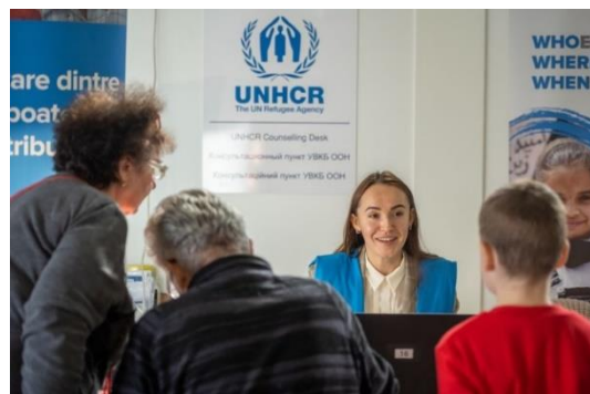
Refugees from Ukraine accessing services at UNHCR's integrated service hub at RomExpo, Bucharest.