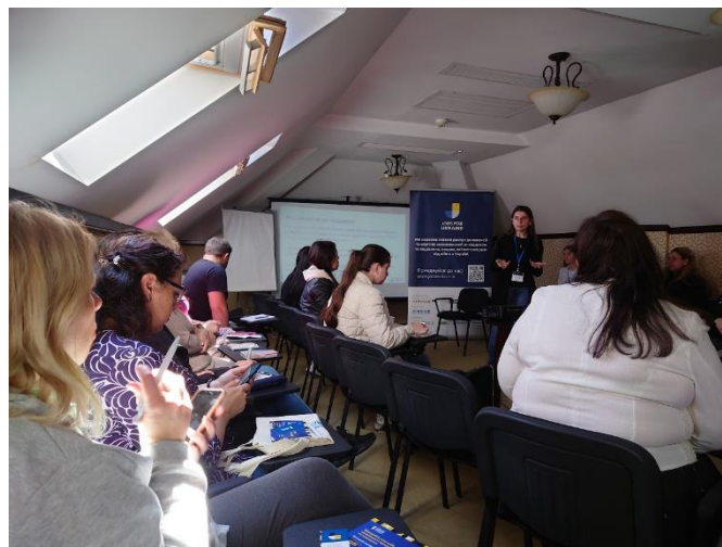
Refugees attend a CV-writing workshop facilitated by Jobs 4Ukraine, Constanţa.