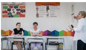
How Romanians view refugees