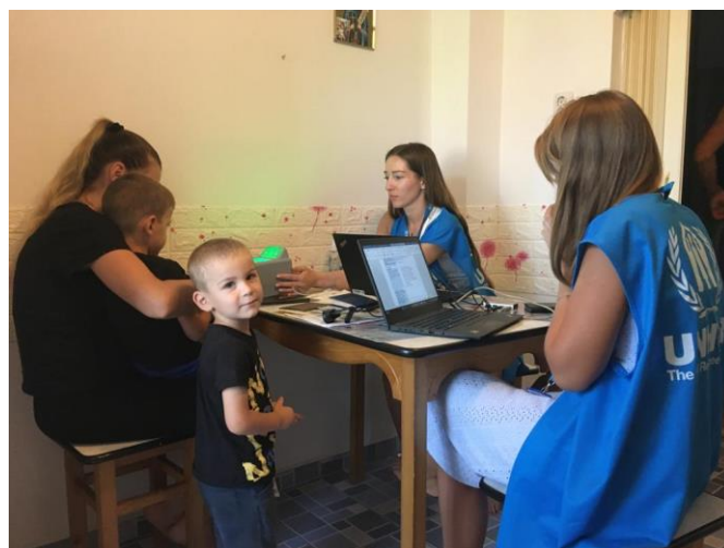
5 enrolment centres in Bucharest, Brașov, Galați, Suceava and Iași. Mobile enrolment teams across Romania.

Cash Assistance: UNHCR's cash assistance programmes are designed in coordination with the Government to complement its efforts to support the refugees from Ukraine. They serve as a transitional safety-net pending the individual's ability to secure employment or be included in national social protection schemes. In 2023, UNHCR's cash assistance has evolved towards more tailored interventions to the most vulnerable refugee population, progressively focusing on a cash for protection programme whose beneficiaries are selected based on a vulnerability scorecard jointly developed by 17 organisations under UNHCR's coordination, which in turn enables partners to assess vulnerability in similar and compatible ways. Deduplication with other cash assistance providers - notably the Romanian Red Cross - is ensured and organisations providing this assistance have agreed on similar transfer values and complementary modalities through the Cash Working Group. In