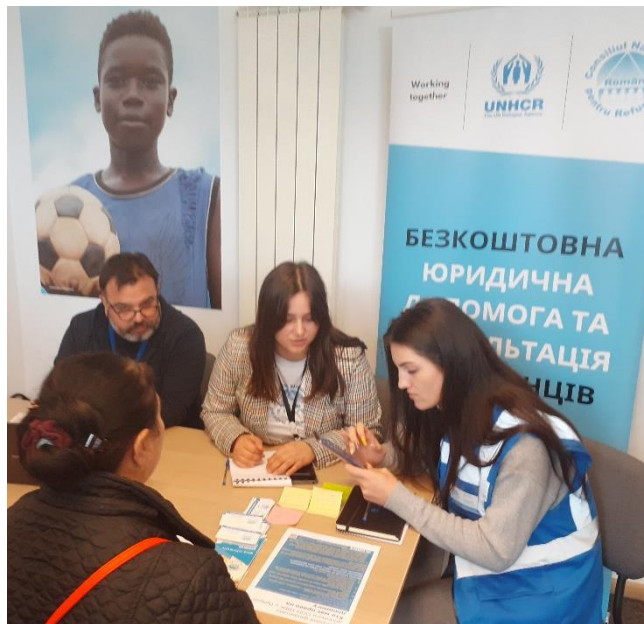
A refugee receives protection counselling from UNHCR partner CNRR at the Service Hub in Galați.

UNHCR leads the Inter-Agency Protection Working Group to help 37 organisations coordinate their protection response and avoid duplication of effort. UNHCR, together with partners Terre Des Hommes and Autism Voices, work in Brașov, Bucharest, Constanța, Galați, Iași, and Suceava, to support children with specific needs, establish child-friendly spaces, ensure psychosocial support, raise awareness, and enhance capacity of the authorities, partner staff, and volunteers. UNHCR, jointly with UNICEF and partners, also advocated on access to education for refugee children from Ukraine to ensure that no child is left behind and - through some child protection interventions - complemented the response from UNICEF and other partners in education.