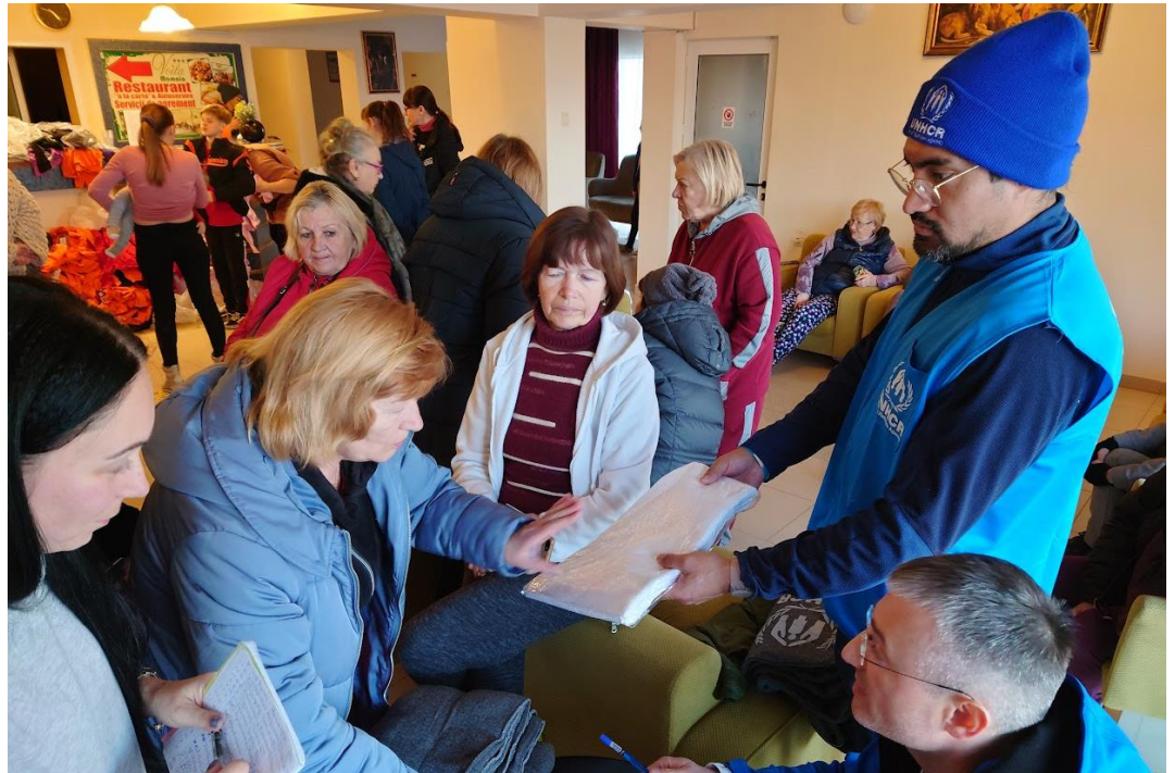
Refugees receiving UNHCR core-relief items in in Constanța.

6,672 refugees reached through employment website, livelihoods counselling and Romanian language courses