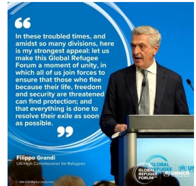
Quote from UNHCR Filippo Grandi at the Global Refugee Forum.

UNHCR is grateful to the donors of unearmarked and softly earmarked contributions to the Ukraine situation. UNHCR in Romania is also grateful to donors contributing to its 2023 programmes. For more details: Romania Funding Update - 2023 | Global Focus (unhcr.org)