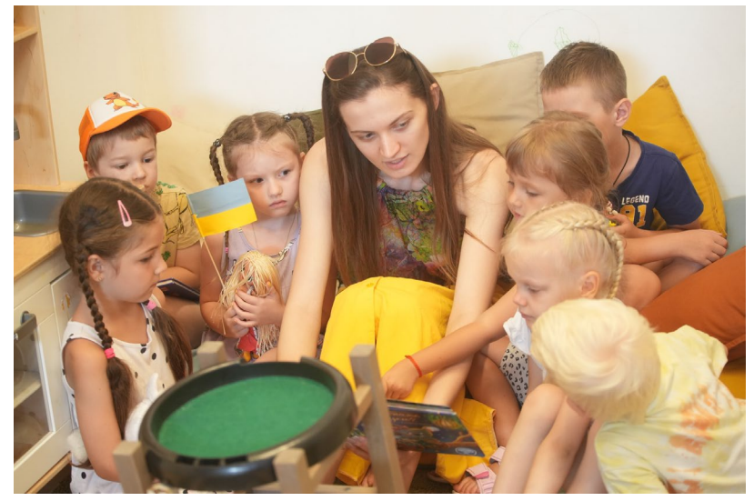
Refugee children from Ukraine in the summer camp organized by UNHCR at the Budapest Helps! Community Center, which is jointly run with the Budapest Municipality and IOM.

1 Multi-country office in Budapest, also supporting national offices in the Czech Republic, Slovakia and Slovenia.