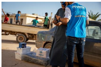
Distribution of humanitarian assistance to flood-affected people, Derna, Libya.