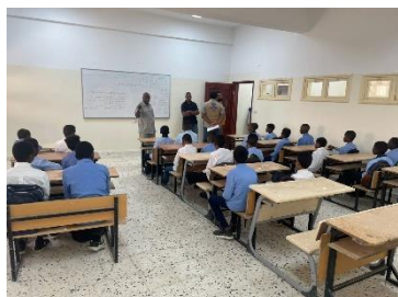
Traghen school, following rehabilitation by UNHCR partner, ACTED.

inclusive sport for all. So far in 2023, 337 children (266 boys and 71 girls) participated in those structured sports activities.