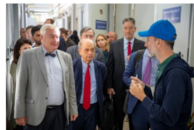
Visit of ambassadors and delegates to UNHCR Registration Centre.