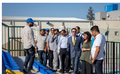
Handover ceremony of Abusalim stadium, with the presence of Embassy of Greece.

On 11 October, a handover ceremony was held for the rehabilitation of seats of the AbuSalim stadium in the presence of the donor - the Embassy of Greece. Since 2021, the stadium has undergone multiple rehabilitation projects and is used for the UNHCR Sports for Peace project, an initiative by UNHCR implemented with Fútbol Más and Moomken, bringing together displaced children and the host community, including refugee children, with sport at its heart with the aim to increase access to protection space and life-skills through safe and