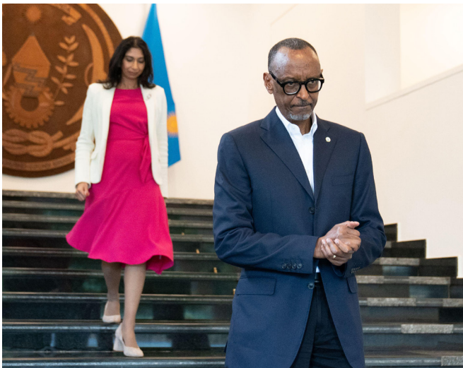
British home secretary Suella Braverman meets Rwandan president Paul Kagame during a visit to Kigali, Rwanda, in March 2023.

The asylum deal is dangerous because it undercuts the UK government’s obligation to abide by the UN Refugee Convention. It also puts the British government into direct partnership with a well-known perpetrator of transnational repression. The