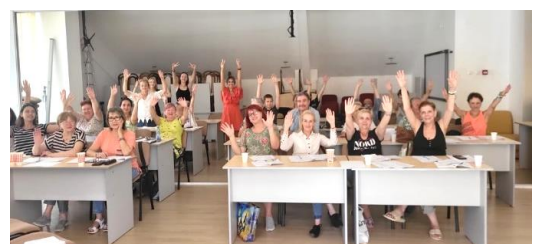
Participants of the intensive language course for job seeker refugees from Ukraine residing in

UNHCR and partners are expanding the geographical reach of Romanian language courses. On 17 August, UNHCR together with Ateliere Fara Frontiere (AFF) started a nine-day intensive language course for 26 job seeker refugees from Ukraine residing in Băile Olănești (central Romania). During this course, AFF is also sharing information on available career opportunities and job-search techniques. So far in 2023, UNHCR and partners supported 465 refugees with Romanian language courses in order to facilitate their inclusion in the job market and society at large.