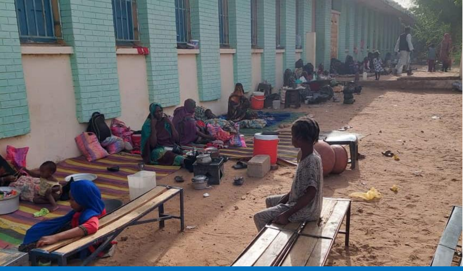
As the security situation allows, UNHCR strives to undertake protection monitoring to inform future interventions. The first such exercise in the Darfur region took place on 24-25 May in Nyala, South Darfur. Across Darfur, multiple sites are reportedly in extremely poor conditions, leading to increased vulnerabilities among the displaced population including women and children.

Deprivation and destitution are compelling families to resort to harmful coping mechanisms, including selling of assets and properties, but also more pernicious strategies such as child labour, sell and exchange of sex, and other forms of exploitative labour, heightening protection risks that remain unmitigated. Even when the security situation allows families to flee to safer areas within the country or to neighbouring countries, their arrival puts an unsustainable pressure on assistance and services at destination, in areas where humanitarian needs were already high. UNHCR's scale up of infrastructures, assistance, and protection programs in refugee sites in the East and in the South of Sudan, often cannot keep up with the fast rate of arrivals. In recent days, food distributions in the East have not been able to cover all needs of all refugee population since the list of beneficiaries was still pre-dating the eruption of the conflict.