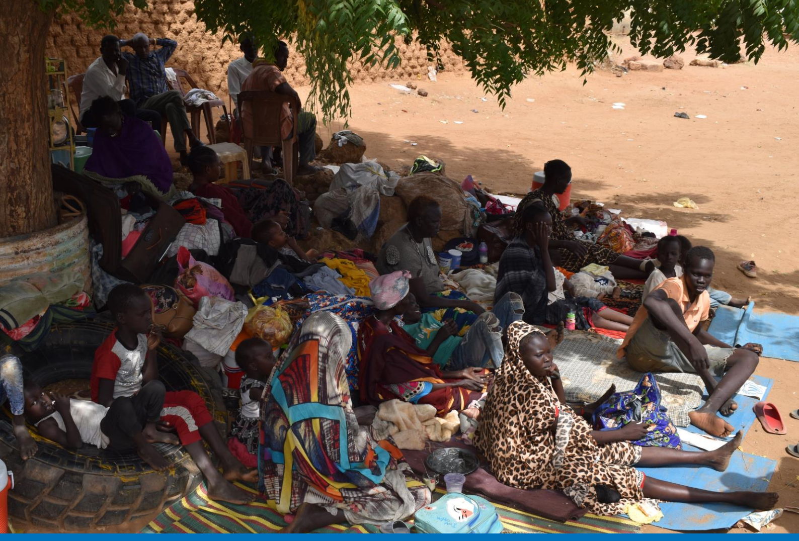
UNHCR conducted a needs assessment among refugees from Khartoum arriving in White Nile State with a view to inform interventions targeting groups at heightened risk including women and children.