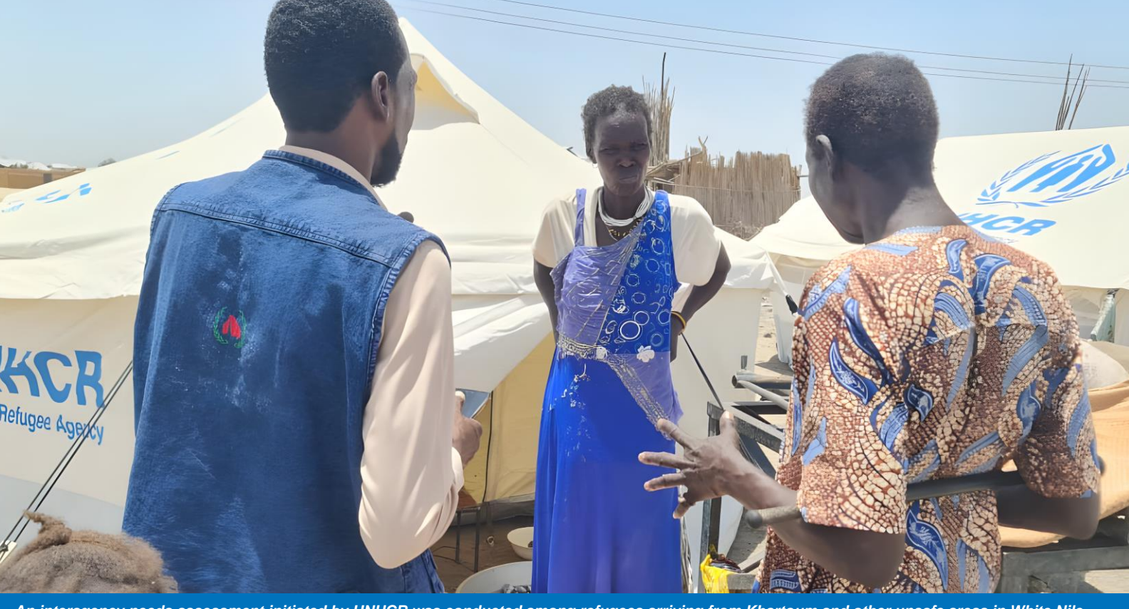
An interagency needs assessment initiated by UNHCR was conducted among refugees arriving from Khartoum and other unsafe areas in White Nile State.

The conflict between SAF and RSF has also triggered intensified intercommunal conflict in certain parts of the country, particularly in West Darfur. This has caused the displacement of at least 250,000 individuals<sup>4</sup> including and devastating effects on the availability of health services, markets, food, water supply and electricity<sup>5</sup> including due to the forced suspension of numerous humanitarian programs addressed to both IDPs and refugees.