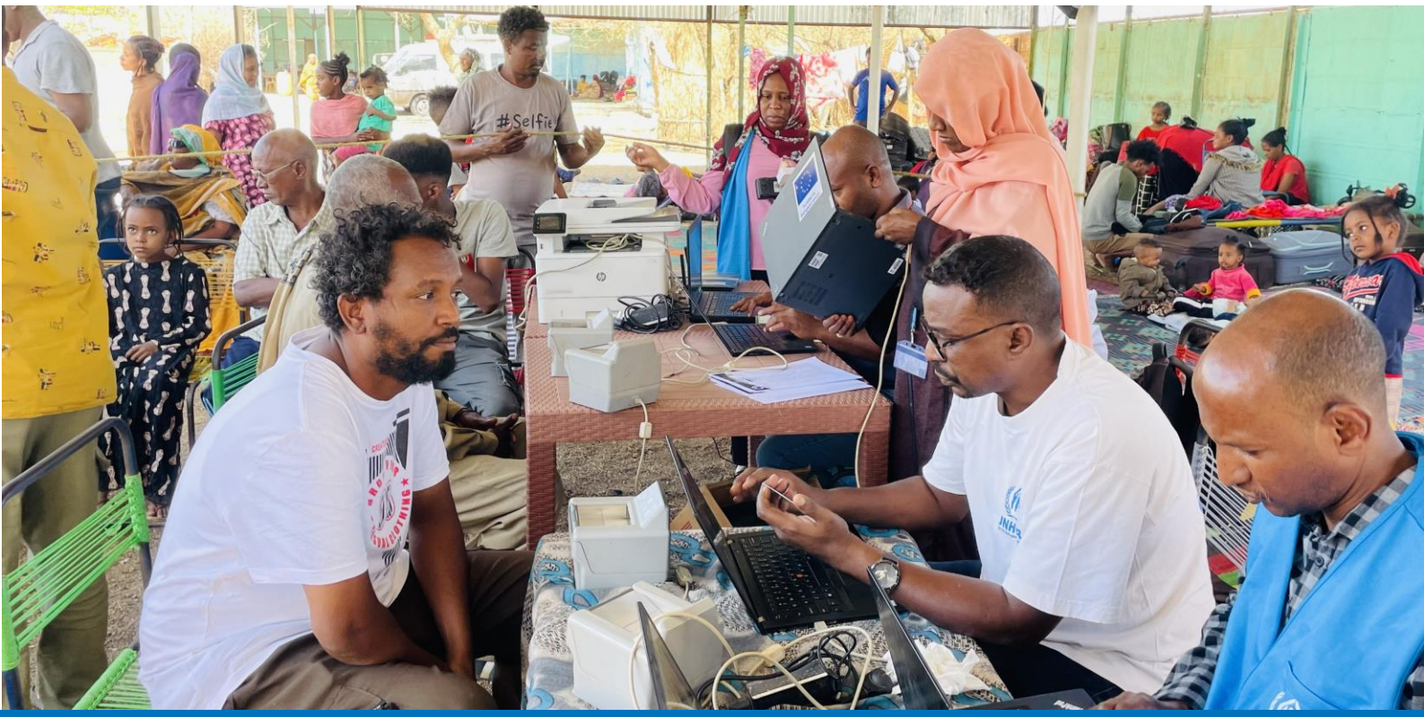
Refugees and asylum seekers who fled to Um Gulja in Gedaref state are undergoing joint registration by UNHCR and the Commission for Refugees for their onward relocation to the camps.

Protection monitoring. Where security and mobility allow, UNHCR teams conduct visits to refugee and IDP hosting areas, including the new sites in Port Sudan, East Sudan States and White Nile State. The Office consults communities with a view to get in-person feedback on ongoing protection risks and challenges in accessing services in close coordination with partners. Protections monitoring through community networks remains active through various activities in East Sudan and White Nile State. In locations affected by conflict, community volunteers who remain in those locations continue to be in touch with UNHCR via phone to report on the situation on the ground. Community outreach volunteers have been active in those areas, identifying protection issues, critical humanitarian and protection needs, challenges in accessing services and reporting on them with a view to help target the response. Where the security situation does not allow, UNHCR tries to maintain contacts with authorities and other key informants, amidst challenges in communication and connectivity.