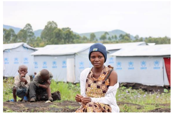
Displaced family at the Bushagara IDP site, in North Kivu, DRC.

Context: As of February 2023, southern Africa was home to 8.4 million forcibly displaced people and refugee returnees . The region comprises the largest IDP situation in sub-Saharan Africa, while refugee camps and settlements in multiple countries, along with some urban areas, host long-term refugee populations – some displaced for many decades. Complex crises cause millions to flee their homes and prevent their safe return. The situation is further complicated by the growing impact of climate change and natural disasters .