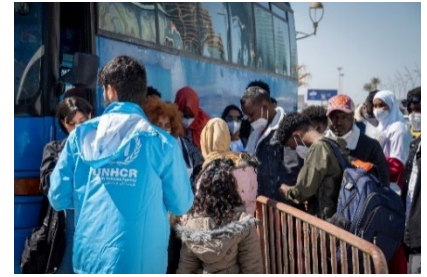
UNHCR staff assisting asylum seekers and refugees on their way to the airport.

On 9 March, UNHCR evacuated 150 asylum seekers and refugees, including 48 women and 46 children, from Libya to safety in Rwanda, on UNHCR's first evacuation flight of the year. The group included children, women at risk, survivors of violence, people with medical conditions, survivors of trafficking and some who had recently been released from detention. In Rwanda, the asylum seekers and refugees will stay at the Emergency Transit Centre, where UNHCR will provide them with accommodation, food, water, medical care, psychosocial support, and language classes, while aiming to find durable solutions such as resettlement to third countries or voluntary return where it is possible. UNHCR continues to urge countries to provide more legal pathways to help some of the most vulnerable asylum seekers and refugees reach safety. UNHCR is grateful to the relevant Libyan authorities for their support and cooperation in facilitating the organization of these humanitarian evacuation flights.