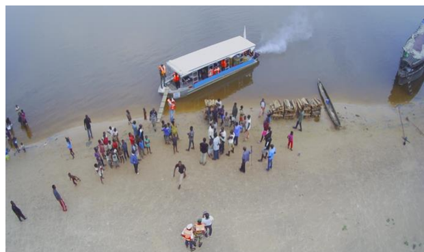
Refugees from the DRC receive support from the Government, UNHCR, and partners in the Republic of the Congo.

Context: As of January 2023, Southern Africa was home to 8.4 million people UNHCR serves . The region comprises the largest IDP situation in sub-Saharan Africa, while refugee camps and settlements in multiple countries, along with some urban areas, host long-term refugee populations – some displaced for many decades. Complex crises cause millions to flee their homes and prevent their safe return. The situation is further complicated by the growing impact of climate change and natural disasters .