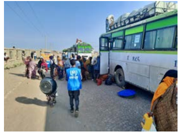
In Afar, UNHCR & partners supported regional authorities in facilitating the voluntary return of 850 IDPs living in Semera and Logiya. They were provided with transportation & assistance.