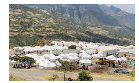
UNHCR provided 190 family tents for IDPs displaced from Oromia in Turkish IDP site. Amhara Region. @UNHCR/Fulem/December 2022