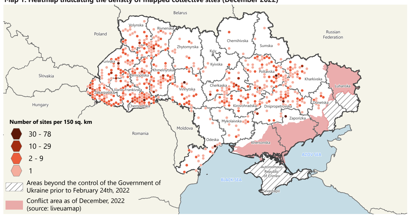
Map 1: Heatmap indicating the density of mapped collective sites (December 2022)