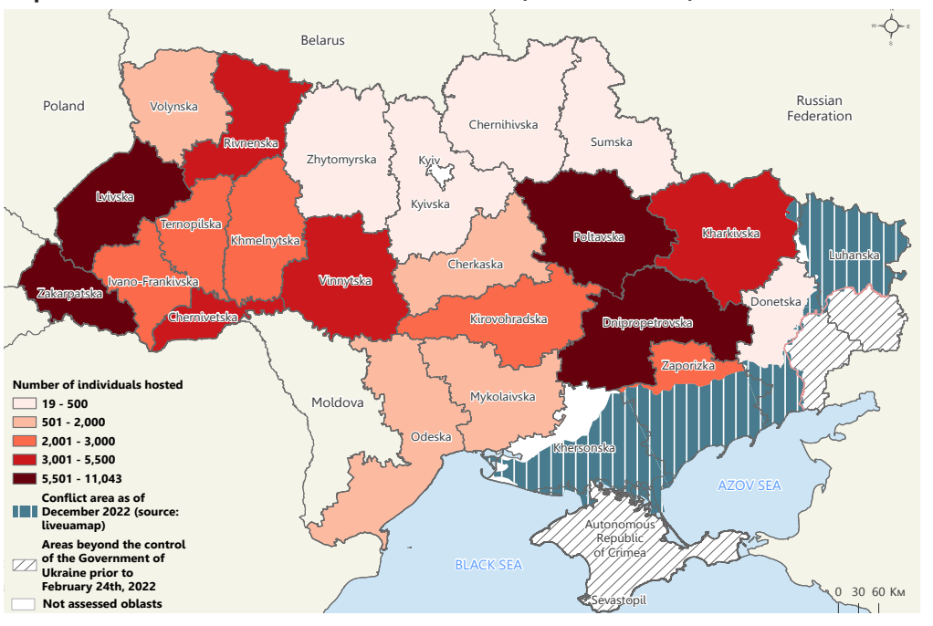
Map 2: Number of IDPs hosted in monitored sites (December 2022)

43% of the CSs (n=419) reported that the organisation responsible for site management had a focal point present at the site only during working hours, while 40% of the CSs indicated the presence of a focal point person 24 hours a day, 7 days a week.