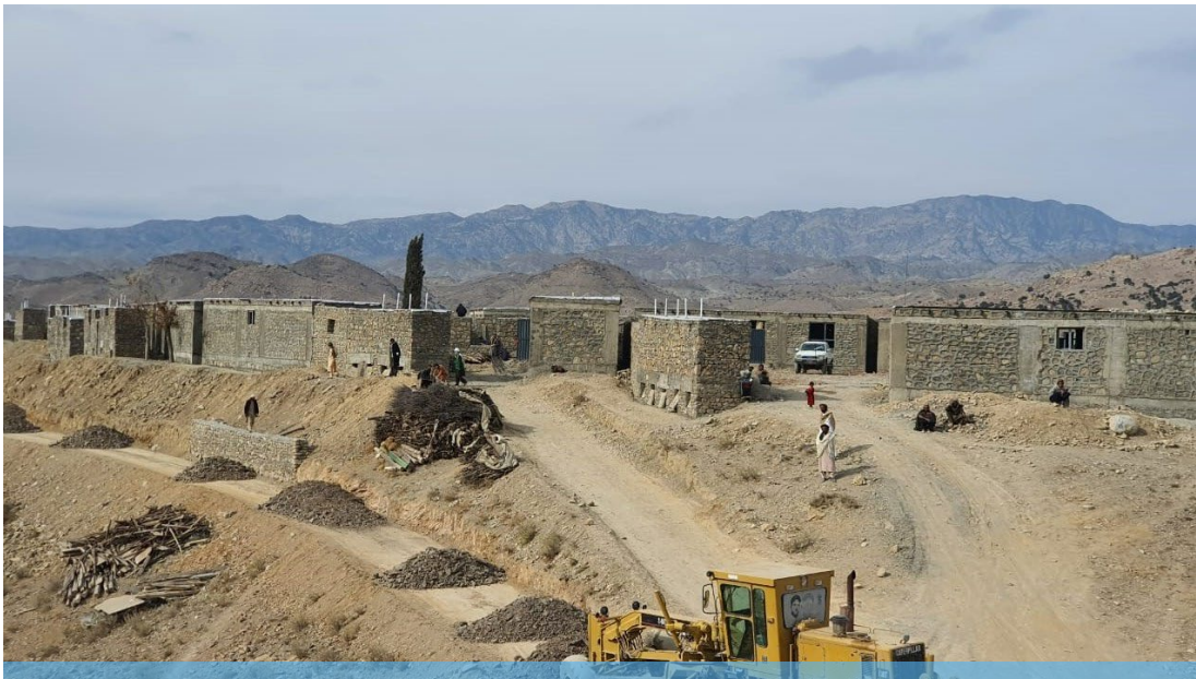
As part of winterization efforts, UNHCR is also supporting the construction of earthquakeresilient housing in Afghanistan's Bamal District, Paktika Province.