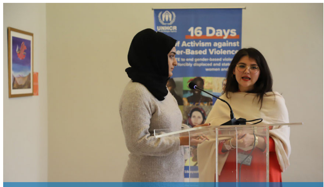
An Afghan refugee artist explains how she uses art to talk about the dreams of women in Afghanistan at an exhibition to mark 16 Days of Activism against Gender-based Violence in Islamabad, Pakistan.