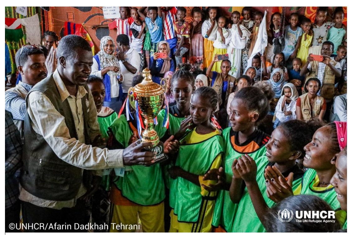
To celebrate World Children's Day on 20 November, Ethiopian refugee children participated in football and volleyball games in Tunaydbah camp, Eastern Sudan. Children could also enjoy one of the child friendly spaces where several performances and activities were carried out.

The number of new arrivals from Ethiopia in November remained low; in November, a total of 99 new arrivals from Ethiopia were recorded crossing into Sudan via Gallabat, Hamdayet and Taya border entry points.