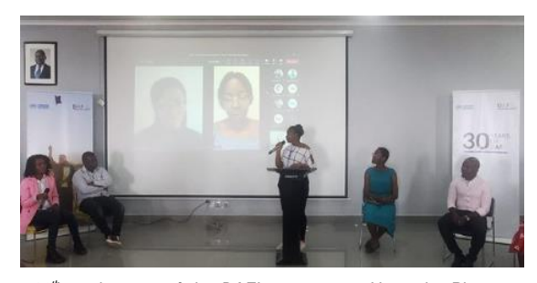
30^{\rm th} anniversary of the DAFI programme, Nampula.

UNHCR has taken steps to expand access to higher education for refugees and asylum seekers in Mozambique. The <u>DAFI scholarship programme</u> offers qualified refugee and returnee students the possibility to earn an undergraduate degree in their country of asylum or home country. On 25 October, UNHCR <u>celebrated</u> the 30<sup>th</sup> anniversary of the DAFI programme in Nampula through an event with speeches from current and alumni students, live music played by refugees from Maratane Refugee Settlement and a photo exhibition.