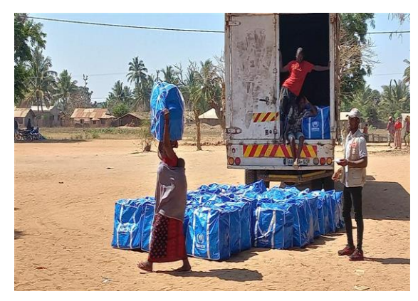
Distribution of core relief items (CRIs) in Erati district, Nampula province.