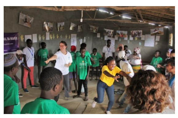
UNHCR and partner conducting mental health and psychosocial support activities with displaced communities in Metuge, Cabo Delgado.