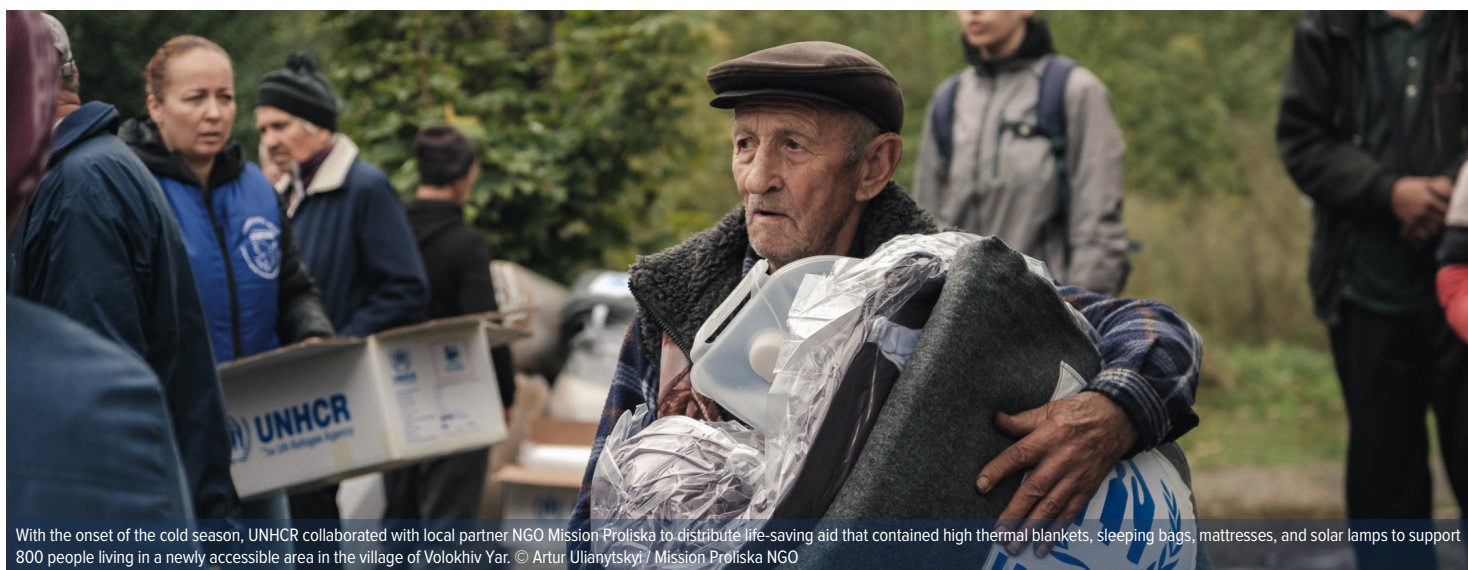
With the onset of the cold season, UNHCR collaborated with local partner NGO Mission Proliska to distribute life-saving aid that contained high thermal blankets, sleeping bags, mattresses, and solar lamps to support 800 people living in a newly accessible area in the village of Volokhiv Yar.

Considering the complexity of the humanitarian situation, the High Commissioner has extended the UNHCR emergency declaration at Level 3 for the IDP response in Ukraine and for the refugee situation in Hungary, Moldova, Poland, Romania and Slovakia, as well as extended the UNHCR emergency declaration at Level 2 for other neighbouring countries, specifically Belarus, Bulgaria and the Czech Republic. The Division of Emergency, Security and Supply continues to work closely with the Regional Bureau for Europe, as well as partners and donors on delivering relief items to the affected operations.