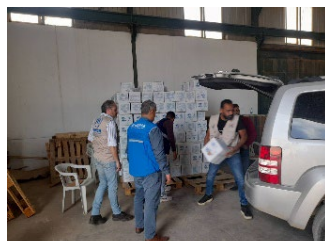
Distribution of food assistance in Benghazi.

UNHCR, with partners, continues to provide help and services to some of the most vulnerable asylum-seekers and refugees. Last week, partner International Rescue Committee (IRC) distributed hygiene and baby kits, blankets, and tracksuits to 141 individuals, including 44 women and 16 children at the Community Day Centre (CDC), and non-food items to 211 asylum-seekers and refugees, including 79 women, during home visits to various areas of Tripoli. UNHCR and CESVI distributed cash assistance to 41 families (85 individuals) in the CDC. Through partner Norwegian Refugee Council (NRC), UNHCR also provided vouchers to 95 families (172 individuals). IRC also provided 338 general health and reproductive health consultations, 71 mental health consultations and referred 17 individuals to public hospitals and private clinics. The medical team also supported 23 individuals through the 24/7 hotline, 14 of whom were referred for secondary medical assessments.