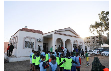
Ceremony marking the rehabilitation work in Al-Hadba Sports Club.

On 21 November, a ceremony took place marking the completion of rehabilitation work at Al-Hadba Sports Club in Abusliem, Tripoli. The project was part of UNHCR's Quick Impact Projects (QIPs) which aim to promote peaceful co-existence between displaced Libyans, refugees, asylum-seekers, and the host community. Work carried out included roofing and electrical repairs, plumbing and sanitary work, repairing doors and windows and repainting. The club is located in an area, hosting returnees, displaced Libyan families, migrants, asylum-seekers and refugees. The event was followed by a friendly football match involving staff from UNHCR and the sports club.