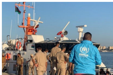
UNHCR staff attending a disembarkation at TCP.

So far in 2022, more than 19,000 asylum-seekers, refugees, and migrants have been reported as rescued or intercepted by the Libyan authorities. Last week, ten rescue/interception operations were carried out by the Stabilization Support Apparatus (SSA) at Al Maya disembarkation point (DP), by the Libyan Coast Guard (LCG) at Azzawya Marsa Delah DP and Tripoli Commercial Port (TCP), by the General Administration of Coastal Security (GACS) at TCP and Sabratha, with 639 survivors, among whom there were 148 people of concern to UNHCR. This was the first time that GACS carried out a disembarkation in Sabratha. Partner International Rescue Committee (IRC) responded to five disembarkations, provided medical consultations, and distributed food and non-food items to the survivors, while UNHCR responded to the disembarkation at TCP on 24 October.