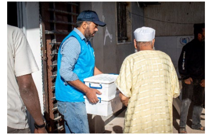
UNHCR staff assisting the NFI distribution.

On 29 October, with partner LibAid, UNHCR completed the distribution of non-food items (NFIs) to Tawerghan internally displaced people (IDPs) in Benghazi. The distribution covered all eight Tawergha IDP settlements in Benghazi and reached more than 1,100 households (around 4,000 individuals). On 25 October, UNHCR and partner LibAid distributed NFIs to displaced families in Wershifana as well. The distribution took place in Zawya and targeted 30 families. The items included mattresses, blankets, tarpaulins, kitchen sets, jerry cans, hygiene kits and solar lamps.