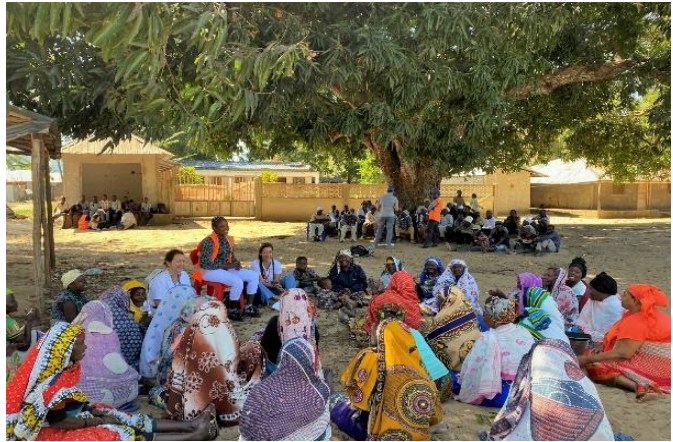
UNHCR and HelpCode conducting focus group discussions with displaced families who recently returned to Palma.