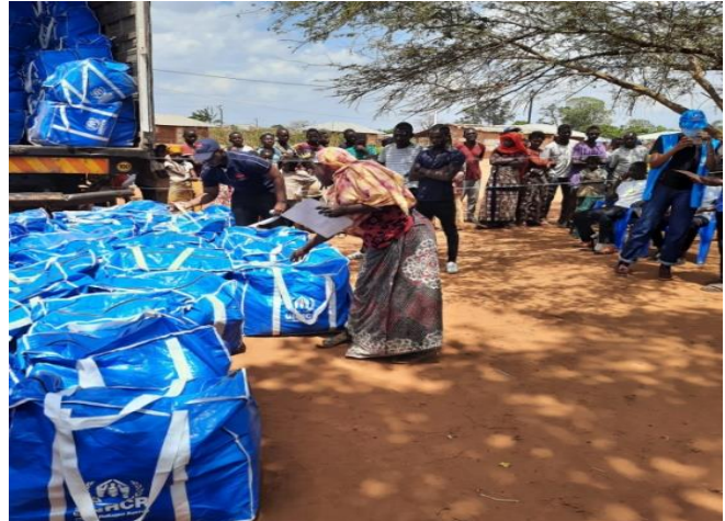
CRI distribution in Corrane IDP Site.