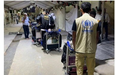
UNHCR staff assisting the refugees for their departure procedures at the airport.

UNHCR helped 32 refugees leave on flights from Libya to be resettled in Canada and Norway, with logistical support from International Organization for Migration (IOM) Libya. The group included four young children. On 18 October, UNHCR facilitated the departure of a 19-year-old Eritrean refugee to Europe for his reunification with his brother through the family reunification process. On 21 October, an unaccompanied child travelled to Europe thanks to a humanitarian visa he was granted. Since 2017, 9,161 asylum-seekers and refugees have departed from Libya on direct resettlement and evacuation flights, as well as through complementary pathways including humanitarian visas and family reunification.