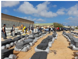
Distribution of non-food items in Ryyadiyah camp, Benghazi.

On 22 October, with partner LibAid, UNHCR started the distribution of non-food items (NFIs) to Tawerghan internally displaced persons (IDPs) in Benghazi. The distribution is planned to continue till 29 October to cover all eight Tawergha IDP camps in Benghazi, with the view of reaching more than 1,100 households (around 4,500 individuals). The items include blankets, mattresses, kitchen sets, plastic sheets, solar lamps, jerry cans, winter boots, socks, and gloves.