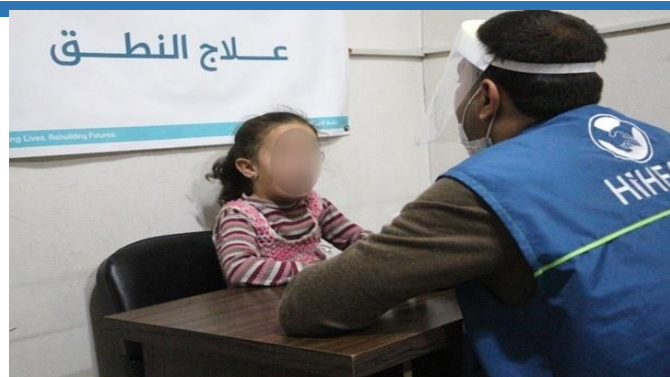
HIHFAD Pysiotherapy Center NWS – Aleppo, Al Bab. July 2022

Reporting period: 01.07.2022 to 31.07.2022