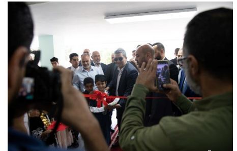
Ceremony at the Al-Mabrouk Haman School.

On 11 October, a ceremony took place at Al-Mabrouk Haman School, Tripoli, which was severely damaged by conflict in recent years. Thanks to extensive rehabilitation work overseen by partner, ACTED, more than 600 pupils, including IDPs, returnees, refugees, and asylum-seekers, will have a better learning environment. Under the project, water and sanitation facilities were renovated and a 2,000-litre water tank was provided. Access was improved for people with disabilities, interior walls were repainted, and new light fixtures were installed. The event was attended by the Minister of Education, the Mayor of Qasr Bin Ghasheer, school teachers and local community.