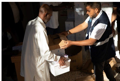
Distribution of core relief items in Abusliem, Tripoli.

On 17 October, UNHCR and partner LibAID provided hygiene kits and other items to more than 100 displaced Libyans who were evicted from Sidi Al-Sayeh settlement. Most still live in the same neighbourhood, although some individuals have returned to Tawergha. The distribution, which took place in Abusliem municipality, Tripoli, included solar lamps, raincoats, and soaps.