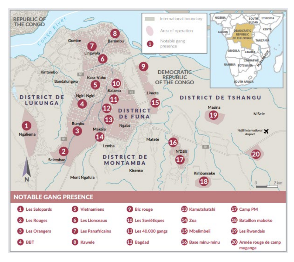
Figure 1. Map of the main Kuluna gangs in Kinshasa.<sup>43</sup>

uniform'.<sup>41</sup> A resident from Lingwala, a district of Kinshasa, stated to GITOC, that the Kulunas recruit the children of PNC officers.<sup>42</sup>