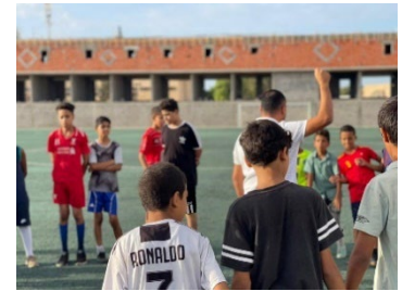
Activities at Abusliem Stadium as part of the Sport for Peace programme.

Special thanks to our major donors: Austria | Canada | European Union | France | Germany | Hellenic Republic | Italy | Malta | RDPP NA | The Netherlands | USA | Private Donors