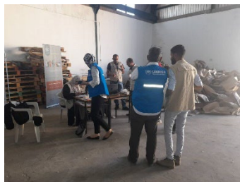
UNHCR-WFP distribution of food assistance in Benghazi.

UNHCR, with partners, continues to provide help and services to some of the most vulnerable asylum seekers and refugees. Last week, partner, the International Rescue Committee (IRC) distributed hygiene kits and baby diapers to 100 individuals, including 39 women and eight children at the Community Day Centre (CDC), and core relief items to 58 asylum seekers and refugees, including 12 women and three children, in Triq Al Sikka detention centre and Libyan Red Crescent (LRC) shelter in Misrata. Partner CESVI provided emergency cash assistance to two households (nine individuals). Partner, the Norwegian Refugee Council (NRC) provided emergency cash assistance in the form of vouchers to 75 households (143 individuals) at the CDC. The voucher