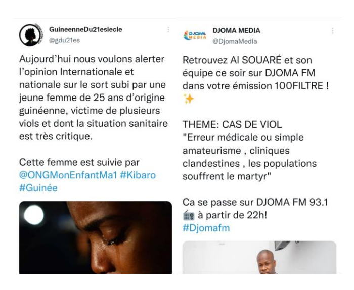
On the left, screenshot of the story published on 13 October 2021 by the Guineenne Du 21 Siècle collective. On the right, screenshot announcing a broadcast on the rape case

Amnesty International calls on the Guinean authorities to set up a toll-free number for victims to report cases of sexual violence, to be informed about their rights, how to access health and support services, including psychological and legal aspects.