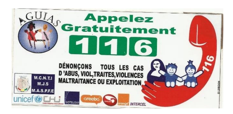
♠ ↑ Artwork posted on the Aguias Facebook page on 26 December 2014<sup>192</sup>

However, according to the same evaluation report, 116 suffers from a long list of dysfunctions such as "charging for incoming and outgoing calls", the "poor coordination of actors involved in the processing and handling of alerts", and the "insufficient number of call handlers to ensure availability of the service 24 / 7 under normal working conditions". Amnesty International made several unsuccessful attempts to contact 116