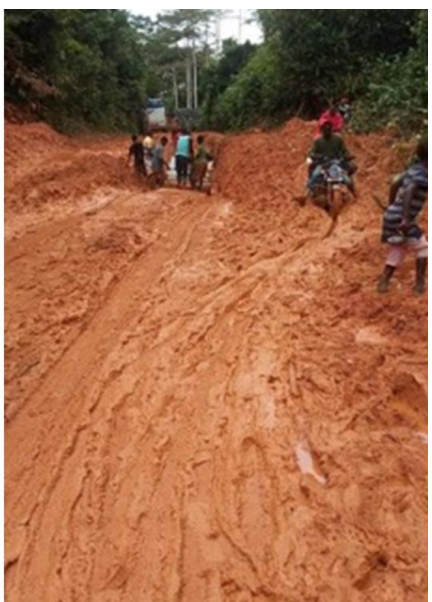
© ^On the left, a view of National Highway 1 (RN1) (November 2021) ©Amnesty International On the right, the road linking Guinea to Liberia in Nzérékoré region © Twitter account @ibrahimabiggy

This lack of resources can also result in some members of the security services asking victims' families to pay the costs of one or more parts of their job. The representative of an NGO fighting against sexual violence told Amnesty International: "Even the police want us to pay for transport, fuel. Once, we caught a rapist but had to pay for transport to go and apprehend him. It's because the police don't get paid. What do you want them to do?" 326