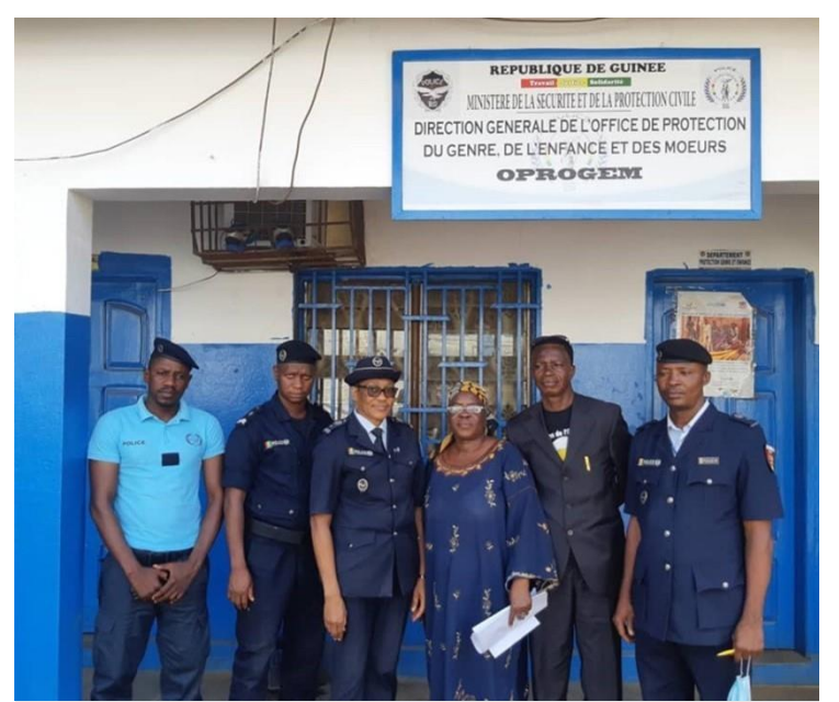
⊕ ↑The Oprogem General Management Team, 1 November 2021.