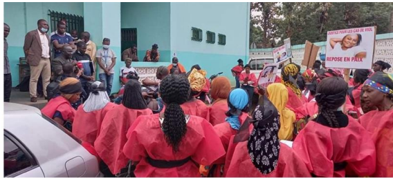
^Left, protest in front of the Department of Defence on 12 December 2019. Right, Protest in Nzérékoré on 30 November 2021 following the death of M'mah Sylla Seriour le Droit Féminin