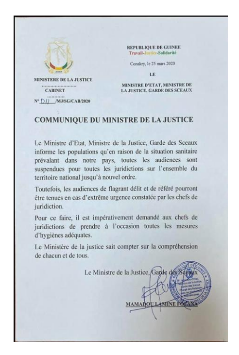
♠ ↑Ministry of Justice press release announcing the suspension of all hearings due to the health emergency

The Covid-19 pandemic has further slowed the operation of the justice system. On 25 March 2020, the Ministry of Justice announced the suspension of "all hearings in all jurisdictions throughout the country until further notice." 350