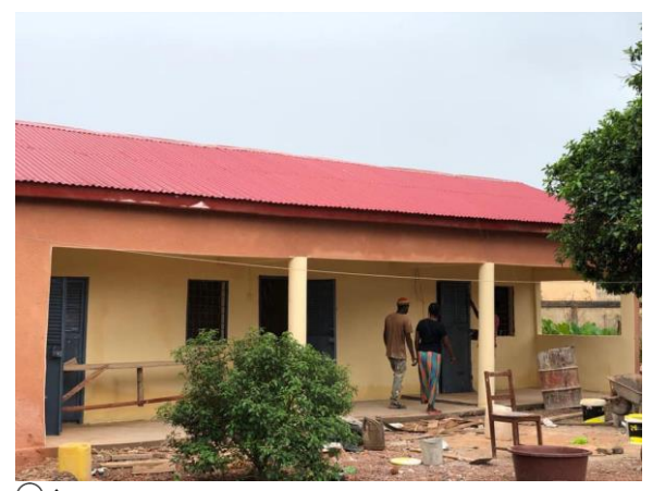
♠ ↑ Photo of the Solidarité Suisse Guinée refuge in Labé. Posted on 5 November 2021 on the NGO's Facebook page.

Amnesty International encourages the State to support the development of these one-stop centres throughout the country to increase the availability, quality and accessibility of specialised care, sexual and reproductive health, psychological and legal support services for victims of sexual violence.