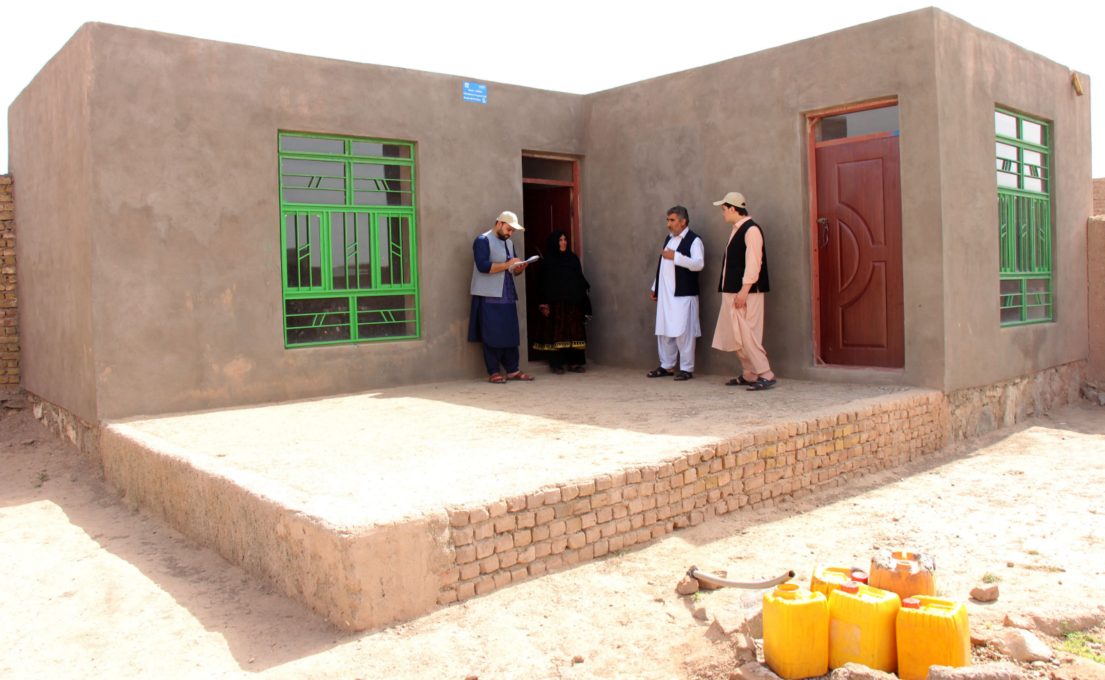
Monitoring of Houses constructed in 2021 in Heat province by AHDAA technical team . Photo taken by AHDAA, August 2022