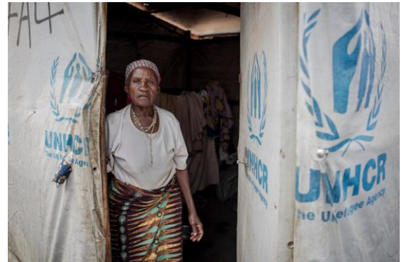
Kigonze camp in Bunia, the DRC, hosts more than 14,000 IDPs.

Solutions: Local integration and voluntary repatriation are the focus for solutions in the region, as opportunities for resettlement remain limited to a small percentage of the overall population. Options to expand complementary pathways are also being explored. Steps towards ending statelessness in the region include reforming nationality law, policy and procedure, and supporting access to documentation.