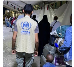
UNHCR staff assisting refugees for their departure procedures.

Special thanks to our major donors: Austria | Canada | European Union | France | Germany | Hellenic Republic | Italy | Malta | RDPP NA | The Netherlands | USA | Private Donors