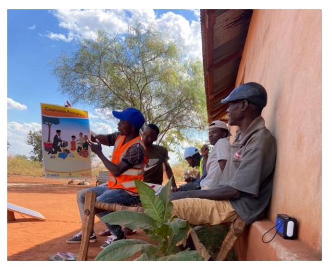
Community Activists dissiminating key messages on early marriage prevention in Mueda District, Cabo Delgado.

<sup>1</sup> IOM/DTM Mozambique - Cabo Delgado, Nampula, Niassa, Sofala, Zambezia and Inhambane Provinces - IDP Baseline Assessment Round 16 - June 2022