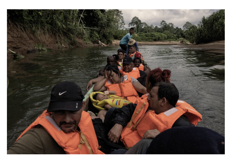
Panama. Refugees and migrants brave hazardous jungles of Darien Gap on their way north