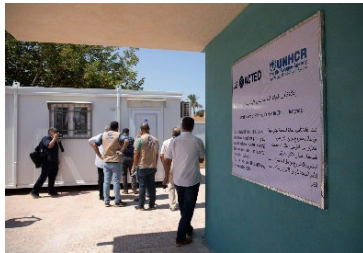
The ceremony at the Sidi Khalifa Polyclinic.

On 26 July, UNHCR evacuated a group of 85 vulnerable asylum seekers out of Libya to safety in Italy, via a UNHCR charter flight. The group are from a mix of nationalities, including some just released from detention. Since 2017, 8,611 vulnerable asylum seekers and refugees flew out of Libya on evacuation and resettlement flights and through complementary pathways.