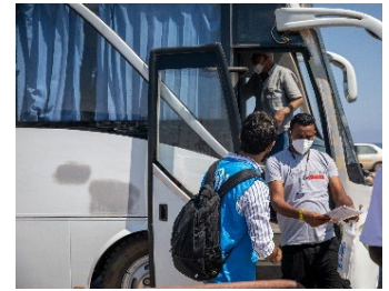
Asylum seekers on their way to the airport.

extensive rehabilitation work included installing new water pumps, water and sanitation facilities and a prefab container, as well as repairs to the roof, installing a new generator to ensure no interruption in services during electrical black-outs, and providing medical equipment, including an ultrasound machine, other diagnostic equipment, and additional furniture for the facility.