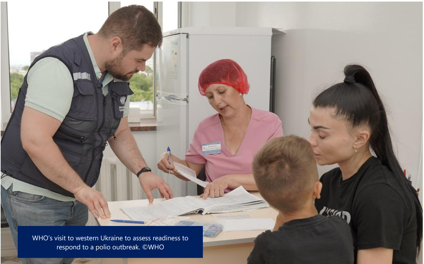
WHO's visit to western Ukraine to assess readiness to respond to a polio outbreak.

Invitees include representatives from UN Agencies and partner organizations and members of the Issue-based Coalition on Health and Well-being (IBC-Health).