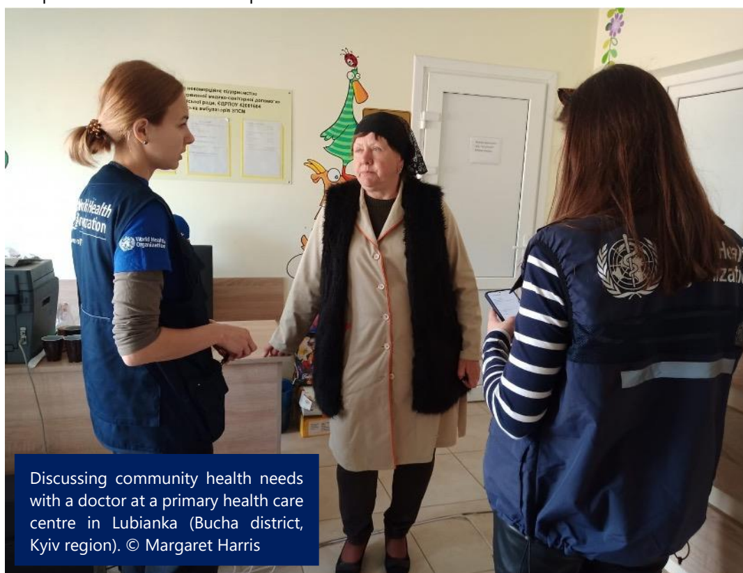
Discussing community health needs with a doctor at a primary health care centre in Lubianka (Bucha district, Kyiv region).