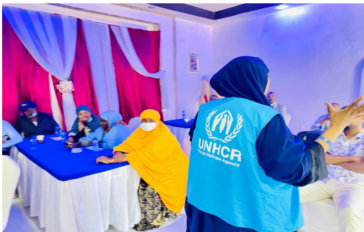
Ongoing orientation and training for some of the enumerators under SO Mogadishu, for the 2022 Participatory Assessment

National Displacement and Refugee Agency (NDRA), ACTED, Development Action Network (DAN), Women's Action Advocacy Progress Organization (WAAPO), Danish Refugee Council (DRC), Legal Clinic, Norwegian Refugee Council (NRC).