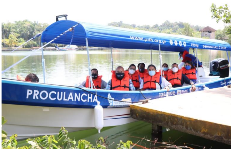
Inauguration of the new "Proculancha" in Izabal by the Human Rights Ombudsman, UNHCR and its partner Refugio de la Niñez.