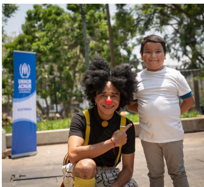
Clowns Without Borders providing a show to Guatemalan and refugee children in different parts of Guatemala.