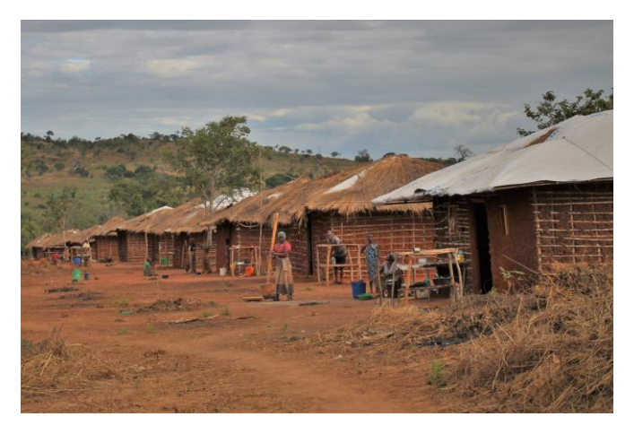
Shelters build by UNHCR and Partner AVSI in Massingire IDP site, Montepuez district, Cabo Delgado.

i IOM/DTM Mozambique – <u>Baseline Assessment Round 15 (February 2022).</u> Cabo Delgado, Nampula, Niassa, Zambezia and Sofala Provinces.