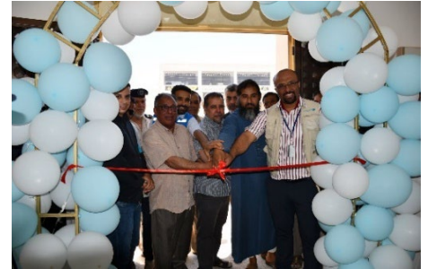
The ceremony marking the completion of the maintenance work of Emsaed School.

On 24 May, a ceremony was held, marking the completion of renovation work of Emsaed School, in Emsaed city, near the Libyan-Egyptian border, eastern Libya. The project is part of the Blueprint for Joint Action by UNICEF and UNHCR, a global strategy by both agencies to collaborate, and strengthen efforts to provide outreach, expanded assistance, and delivery of essential services and protection to support children on the move. Work at the school, which started in October 2021, included the installation of new windows and doors as well as electrical cabling. Water, sanitation, and hygiene facilities were also renovated in order to make them accessible to children with disabilities. The school was repainted, inside and out, and shading was provided for the school yard. A new entrance was also built, making it easily accessible for children with physical disabilities.