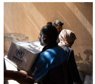
Distribution to Tawerghan families.

UNHCR provides health services through its partner IRC, in public primary healthcare centres in different municipalities in the capital, Tripoli. IRC provided 107 general, reproductive, and mental health consultations, and referred 16 individuals to public hospitals and private clinics. 58 medical consultations were provided in Triq Al Sikka DC and 60 medical consultations were provided in Ain Zara DC. The 24/7 medical emergency hotline team continues to support persons of concern. Last week, 34 individuals were assisted, and 13 were referred to secondary health facilities.