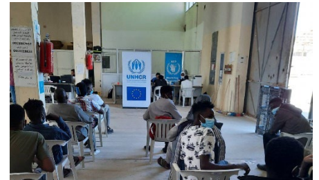
Asylum seekers being processed by UNHCR and partner staff following their release from detention.

On 23 May, UNHCR helped with the transfer of 99 asylum seekers, including 46 children, from Ain Zara detention centre. UNHCR and partners provided medical, food and cash assistance while specific services were provided to those identified with other urgent needs, including shelter arrangements. The individuals will be assisted with core relief items in the coming days. UNHCR continues to work closely with the Libyan authorities to secure the orderly release of other refugees and asylum seekers held in detention. As of 22 May, it is estimated that there are 2,772 persons held in detention centres across Libya, of whom 755 individuals are persons of concern to UNHCR.