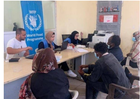
Asylum seekers being processed by UNHCR and partner staff following their release from detention.

On 9 May, UNHCR helped with the transfer of 59 asylum seekers, including 12 women and 38 children, from Ain Zara detention centre. UNHCR and partners provided medical, food and cash assistance to the group and specific services were provided to those who were identified with other urgent needs, including shelter arrangements. UNHCR continues to work closely with the Libyan authorities to secure the orderly transfer of other refugees and asylum seekers being held in detention to urban settings. As of 8 May, it is estimated that there are 1,717 persons held in detention centres across Libya, of whom 765 individuals are persons of concern to UNHCR.